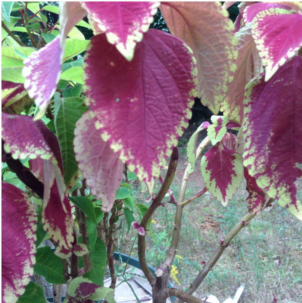
Sherrill Bokousky Watatic Spring