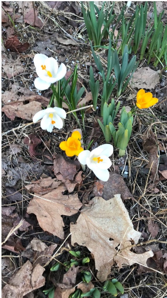
Peggy morgan Rockingham Grange 183 Spring Division 1