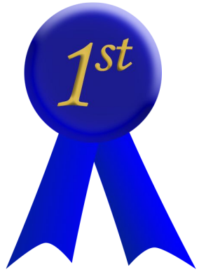
Beth Merrill Antrim Grange #98 Category D Event Planting Community Garden