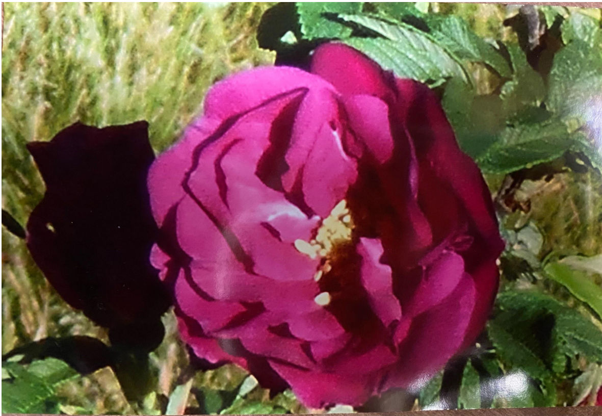
Carol Hill Rockingham grange Spring Division 1