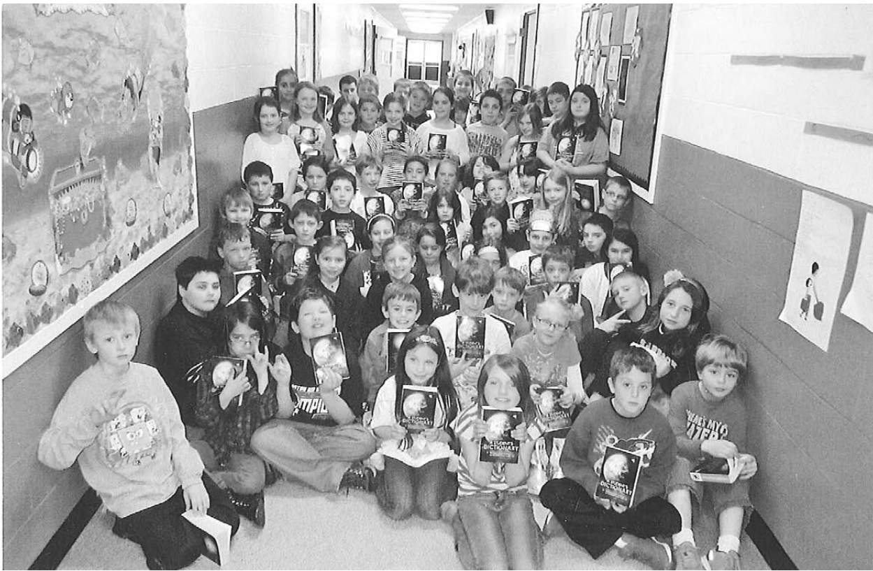
Hampton Falls Grange #171 & Seabrook Lions Club Deliver Dictionaries to Third Graders at Seabrook Elementary School.