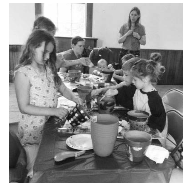
Working on planter crafts at Junior Fun Day.

Then it was time to clean up the Grange Hall before the final event of the day, a trip to Chuckster's for Mini-Golf. The group gradually dispersed from Chuckster's, after completing as much of the course as the children of various ages could handle.