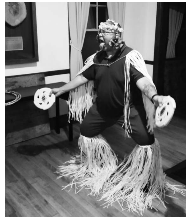
Luau Night at Londonderry Grange in August.