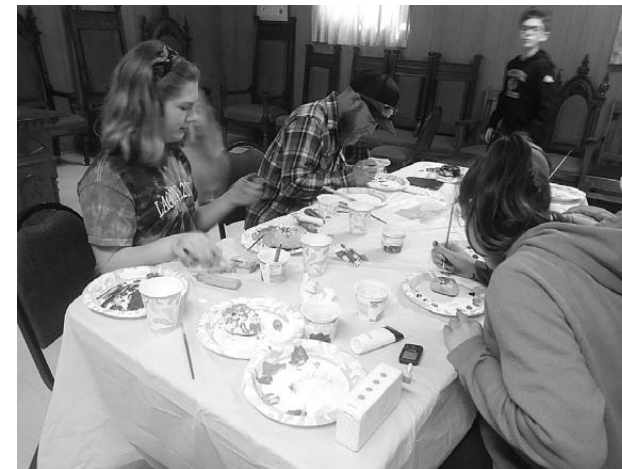
Painting Rocks at Junior Rally